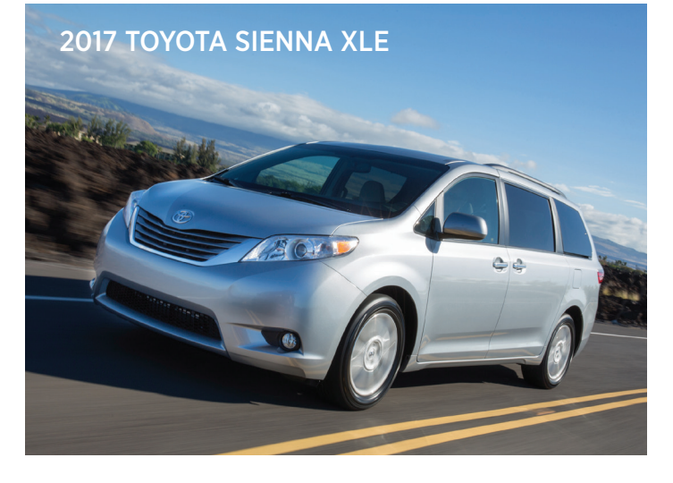
Standard and Optional Features in the 2017 Toyota Sienna