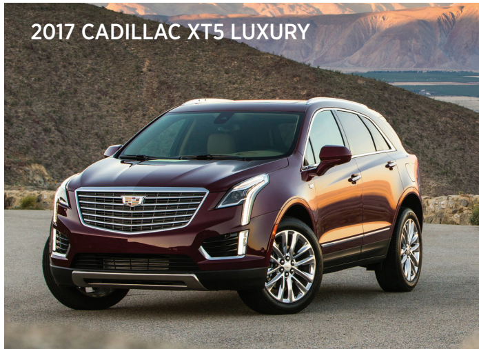
2017 CADILLAC XT5 LUXURY